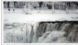
Niagara Falls Has Frozen Because of the Polar Vortex (Well, Kinda, but the Pics Are Still Super Cool to Look At)