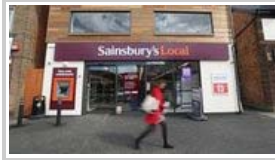
Meat Aisle Masturbator Banned From all UK Supermarkets