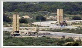
Israel's National Missile Shield Could Shoot Satellites Out of Orbit