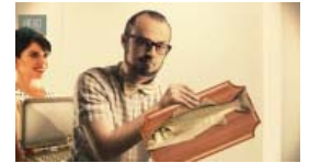
James May Explains How Digital Cameras Work