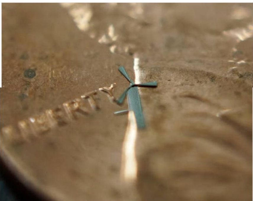
An actual micro-windmill from UT-Arlington, held against a penny.

Electronics manufacturers have been pursuing the idea of a "self-recharging" smart phone for a few years, but most of these efforts have been just chasing windmills. But by using actual windmills of tiny microscopic sizes a group of researchers at the University of Texas at Arlington thinks they've developed the self-recharging phone. Their work is promising enough that WinMEMS Technologies, a Taiwanese metallic fabrication company, has already snatched up the commercial rights, and someday we may charge our cellphones just by holding them up outdoors.