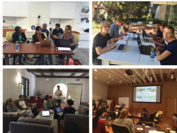
Fig. 1. JPL Center for Climate Sciences Summer School in 2016. CMDA provided datasets and tools for students to use for their group research project during the school.

CMDA has been used as an educational tool for the summer school organized by JPL's Center for Climate Science in 2014, 2015, and 2016 [25]. The theme of the summer school is using satellite observations to advance climate models, which is well aligned with the main goal and capability of CMDA. The requirements of the educational tool are defined with the interaction with the school organizers, and CMDA is customized to meet the requirements accordingly. Since CMDA needs to be used simultaneously by over 30 users (students and instructors) during the school, we have imported CMDA to cloud computing resources provided by Amazon Web Services (AWS). The cloud-enabled CMDA provides each student with an independent computing resource and working environment while the user interaction with the CMDA system remains the same through its web-browser interface.